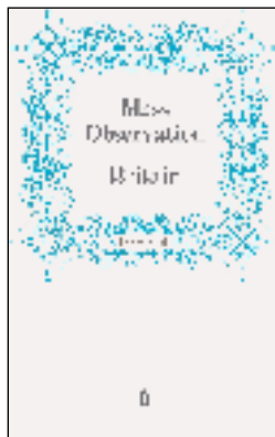
Britain by MO in 2009

habits of people in Bolton's pubs, the themes the books cover are diverse. Titles included in the re-issued are: Britain , First Year's Work , May the Twelfth , The Pub and the People , War Begins at Home , War Factory , Meet Yourself on Sunday , Meet Yourself at the Doctor's , Puzzled People , and Report on Juvenile Delinquency . To find out more about how to purchase these books please visit Faber's website www.faber.co.uk