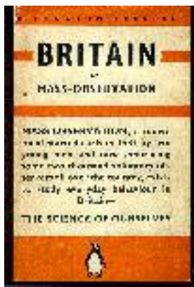
The first edition of Britain was published in 1939

Twenty-five books were published during Mass Observation's first phase of activity. These publications brought together material collected by the organisation's dedicated panel of observers and diary writers. They now offer an extraordinarily vivid glimpse of a time which will soon not be accessible to living memory.